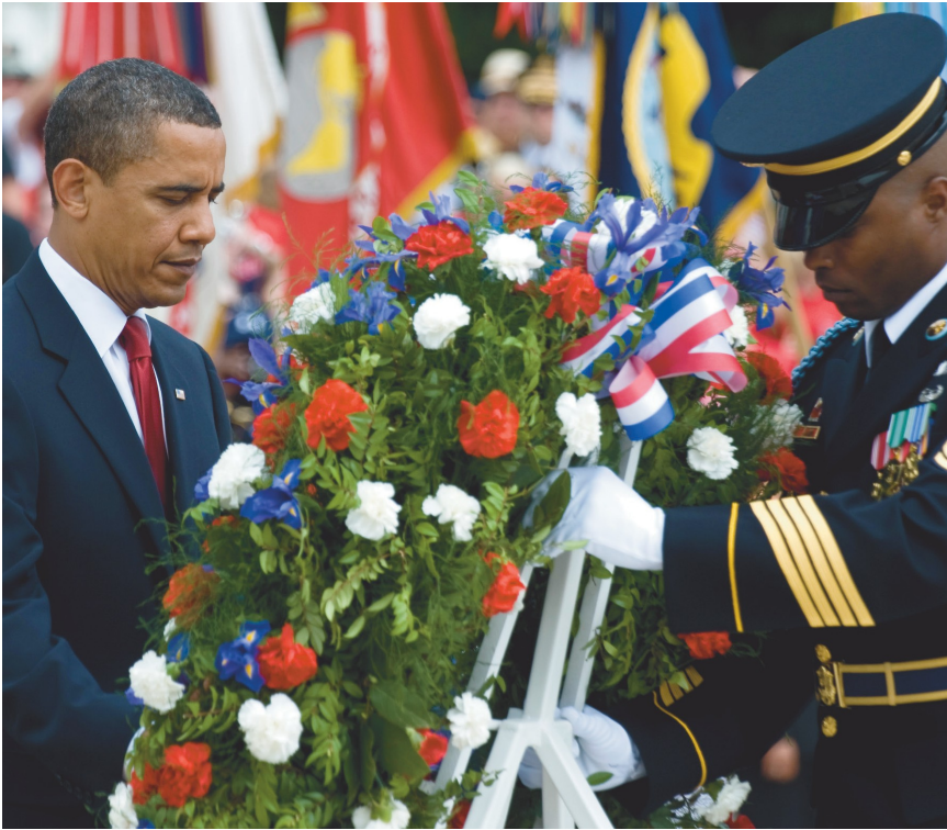
Photo: President Obama lays a wreath at the Tomb of the Unknowns at Arlington National Cemetery, Memorial Day 2009. Public domain image by the U.S. Army.