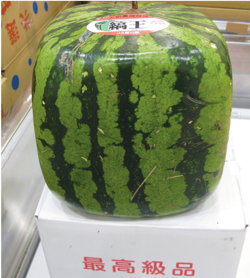
Photo: A square watermelon for sale in a shop in Japan, January 2007. © 2007 by runpleteaser at flickr. Some rights reserved ( http://creativecommons.org/licenses/by/2.0 ).