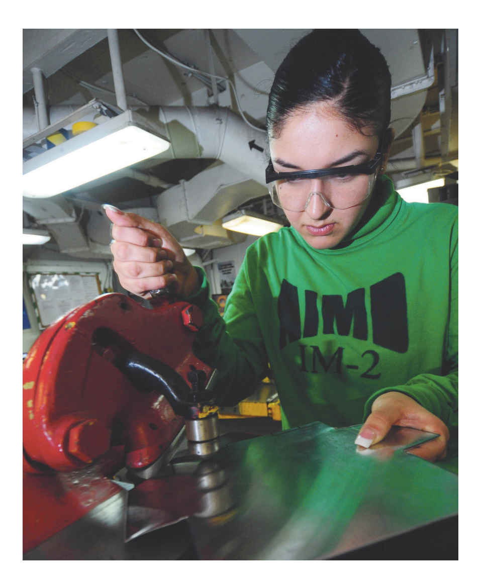
Photo: An aviation structural mechanic fabricates metal parts aboard an aircraft carrier near the California coast, February 2009.