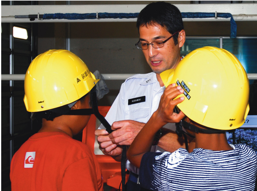
Photo: Students put on safety helmets before entering an earthquake simulator in Yokosuka, Japan, October 2008.