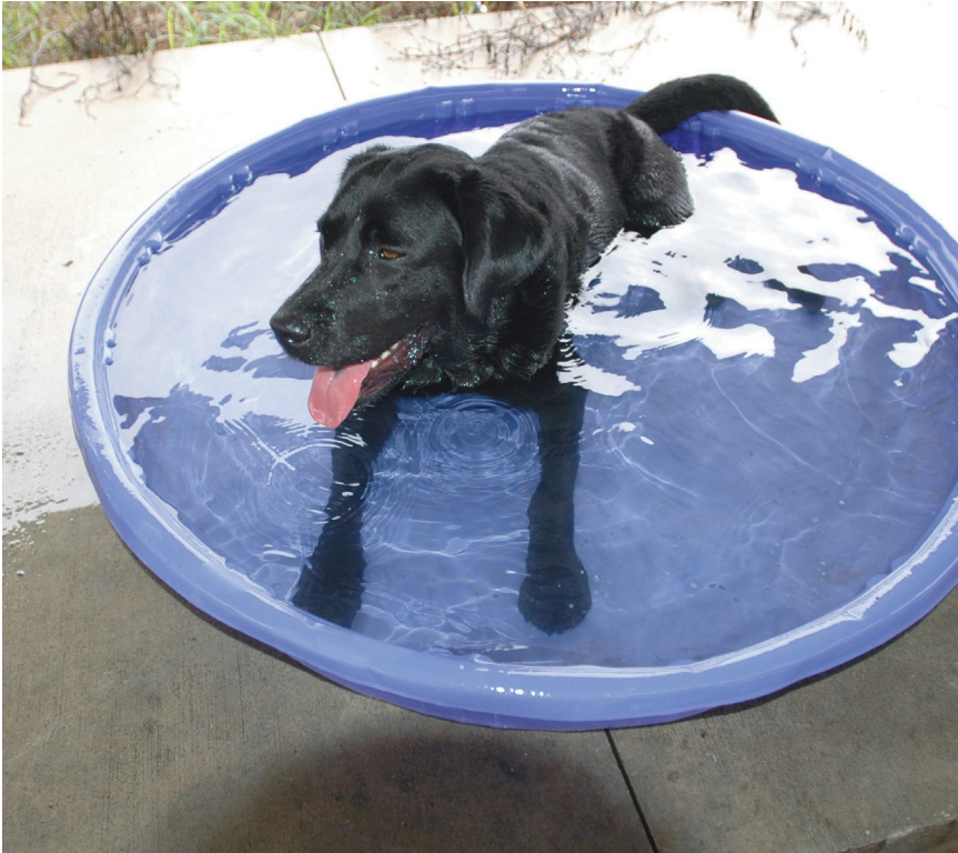
Photo: A search-and-rescue dog in training takes a break in a wading pool in Orlando, Florida, June 2005.

After a snowy winter and a rainy spring, most people are happy for the hot temperatures of summer. In many parts of the country, school is out. You can do things in the summer that you can't do when it's cold. You can plant a garden. You can spend an afternoon at the park. You can have a cook-out with your family. You can go swimming and play baseball. Summer is a time for being outdoors.